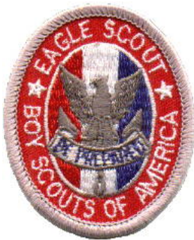
Eagle Rank Badge

From the achievement of First Class through Eagle, the Scout will be demonstrating leadership, performing service projects, earning merit badges and using the skills learned while achieving the rank of First Class. The next ranks he will earn are Star and Life. These ranks are harder to obtain than the earlier ranks, but are also more interesting for the older scouts. Upon completion of all the requirements for Star and Life the Scout will be eligible to work for Eagle. The original principals, the Scout Oath and Law now have fuller meaning for the Scout and their understanding of them is much greater. The final steps towards Eagle are filled with leadership experiences.