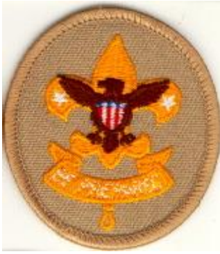
First Class Rank Badge

From the time the Scout enters the Troop through the time he earns advancement to First Class, he is learning basic scouting skills to enable him to camp, hike, swim, cook, tie knots, administer first aid, and perform other tasks in the outdoors and to work as a member of a team. With those first steps the scout begins to build themselves physically, mentally, and morally. He will start to live with the Scout Oath and Law. Soon he will learn the symbolism inherent in the Scout badge; he will learn that there are three points of the trefoil which stand for the three parts of the Scout Oath: Duty to God and country, duty to other people, and duty to yourself. The goal of this Troop, is for the Scout to achieve the rank of First Class within his first year in the Troop. This is a sign